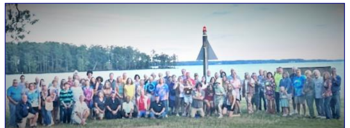
The 2023 D/26 Cruise & Rendezvous, hosted by America's Boating Club of Lake Murray, attracted 92 participants.