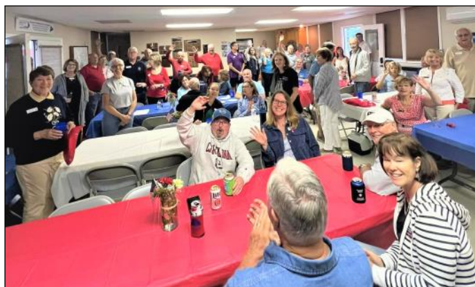
Photos from the D/26 Cruise & Rendezvous — Meet & Greet Happy Hour is seen above and the night cruise to the Lake Murray Dam is captured below.

Everyone stay safe this summer and look forward to seeing you all on the water soon!