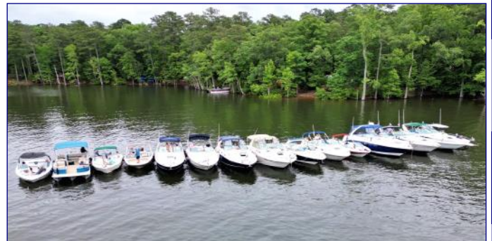
Lake Murray members bring out their boats to host fellow squadron members from D/26 at a raft up on Lake Murray during the Cruise & Rendezvous.